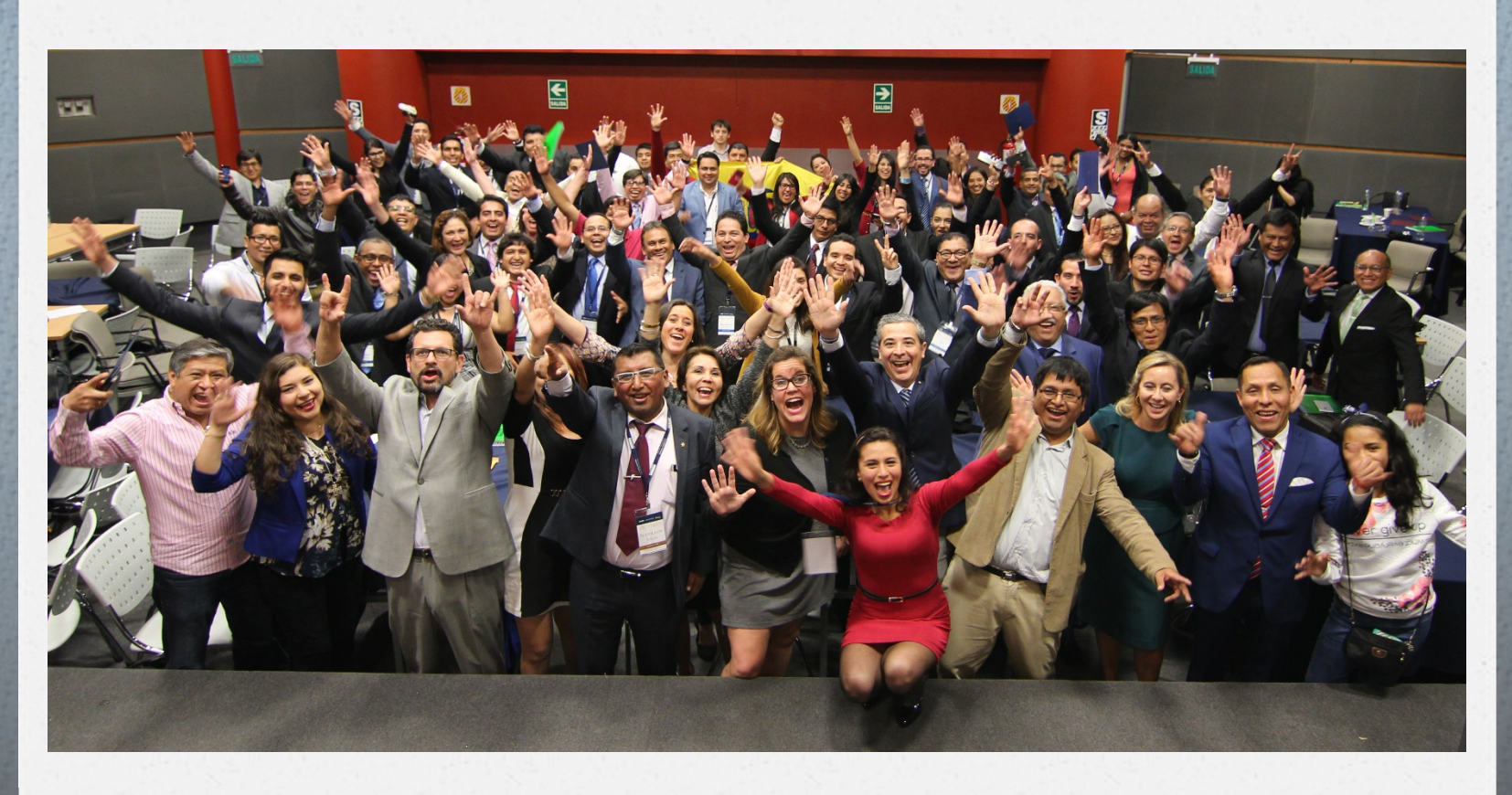
Lima - Peru / October 2016